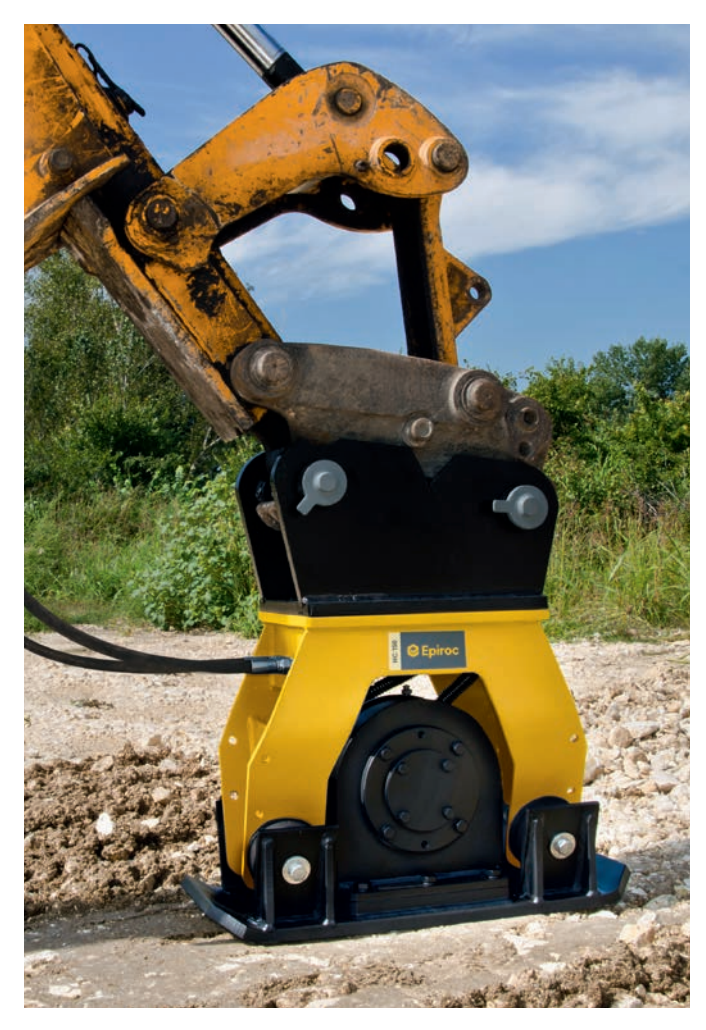
Our low-noise Hydraulic Compactors work quickly, are simple to operate and make positioning easy.